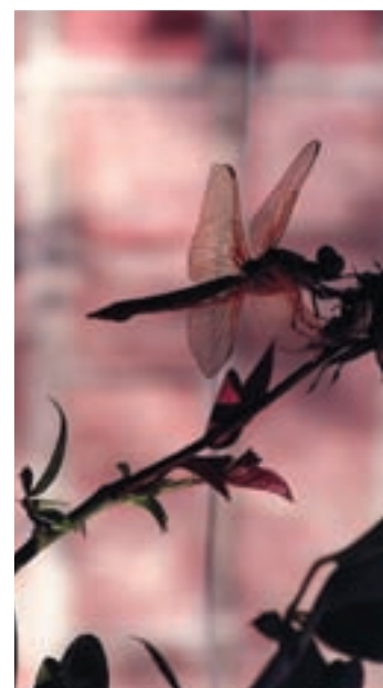
The World in Pictures — Natural History