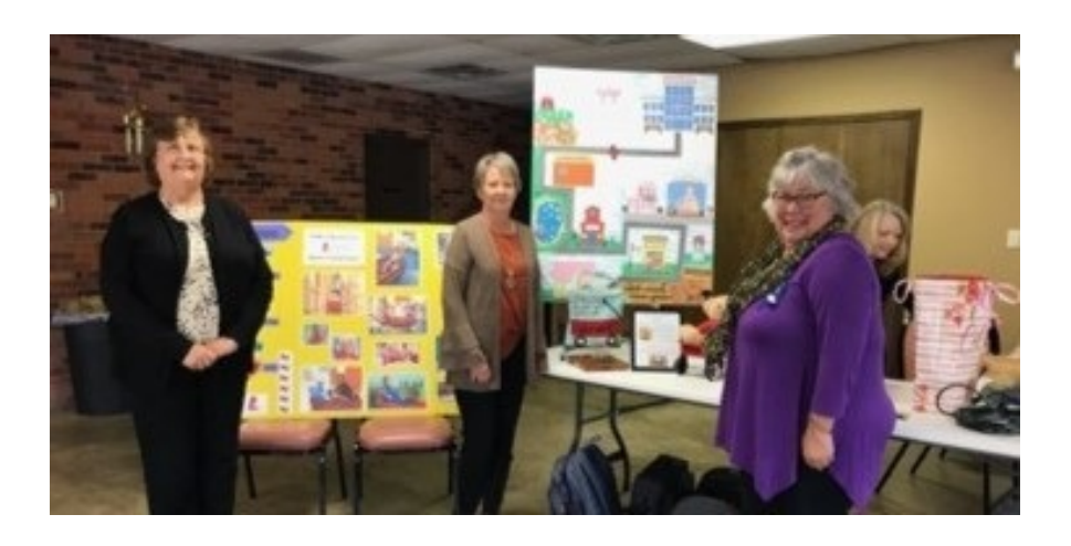
Missouri State President's Project

Encourage all journalists you know who have helped advance women's rights to apply by April 30, 2023. The application form is available on the GFWC Member Portal. All journalists who contribute to newspapers, broadcast news programs (radio, television, and digital), magazines, or online publications, either on staff or in a freelance capacity, are welcome to apply.