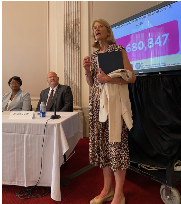
Senator Lisa Murkowski (R-AK)