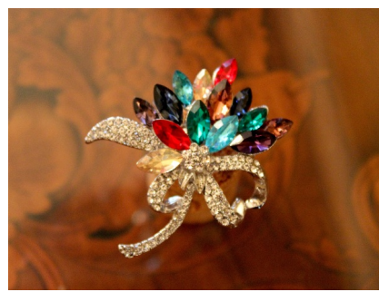
$50 Small Pins (1.5in diameter)