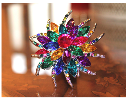
$100 Large Pins (2.5in diameter)