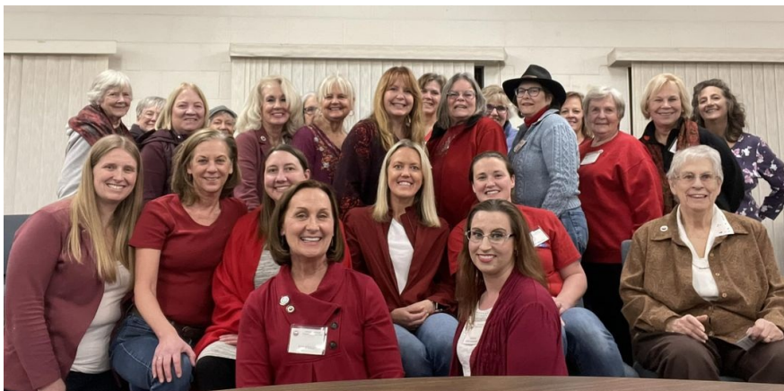
Southwest Region Women's Club (CO)