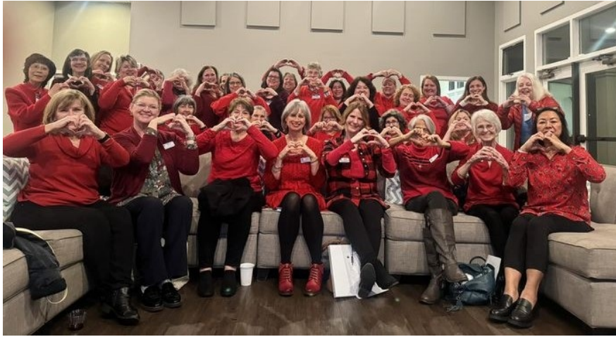
Beaverton Woman's Club (OR)

Our social media feeds were lit up in red last week as GFWC clubs participated in National Wear Red Day, helping to raise awareness of women's heart health. Cardiovascular disease is the number one cause of death for American women, and the first Friday in February - American Heart Month - is set aside for raising our voices for research and education. Here are just three of the many clubs who participated!