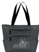
WHRC Tote Bag