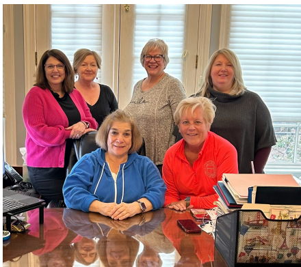
GFWC Illinois Executive Committee

With the opportunity to shadow, as your program progresses, you will find members are more comfortable stepping into leadership roles.