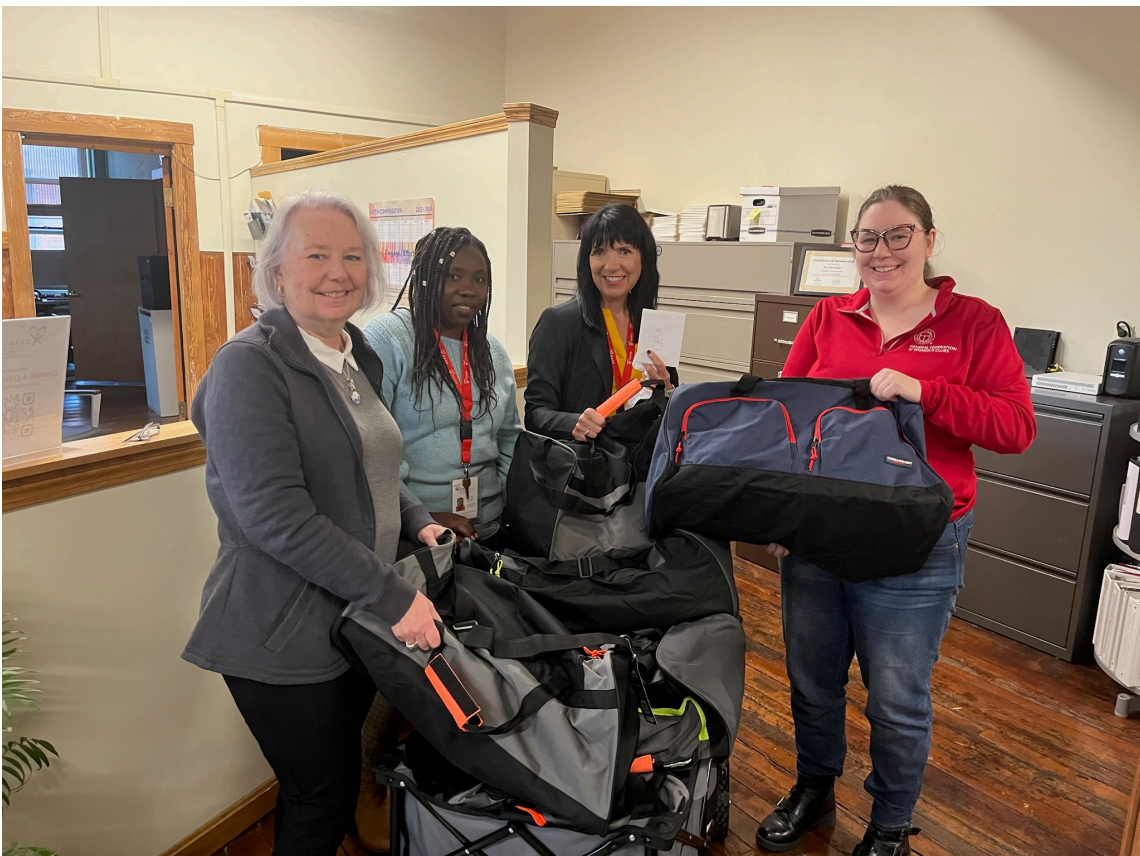
To participate in Advocates for Children Week in 2023, members of the GFWC Auburn Junior Woman's Club worked with CASA, Court-Appointed Special