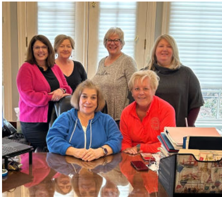
GFWC Illinois Executive Committee

With the opportunity to shadow, as your program progresses, you will find members are more comfortable stepping into leadership roles.