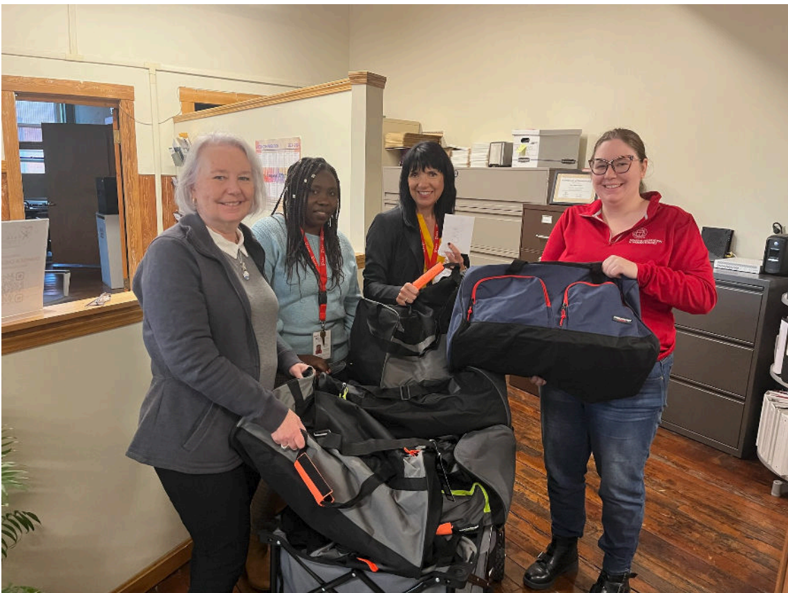
To participate in Advocates for Children Week in 2023, members of the GFWC Auburn Junior Woman's Club worked with CASA, Court-Appointed Special