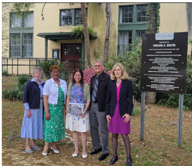
GFWC Gainesville Woman’s Club (FL) with City Commissioners