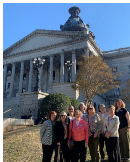
GFWC South Carolina outside the State Capitol