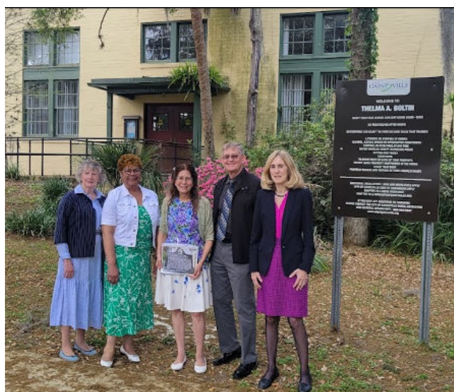
GFWC Gainesville Woman's Club (FL) with City Commissioners