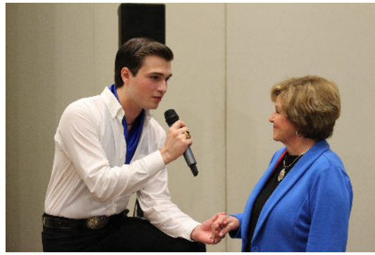
Elvis was in the building!