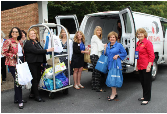
The MAR 2024 GFWC National Day of Service Project "Fill the Bus."

also donated $500 for the GFWC Annual Giving program designated for the Façade Restoration and Beautification Project .