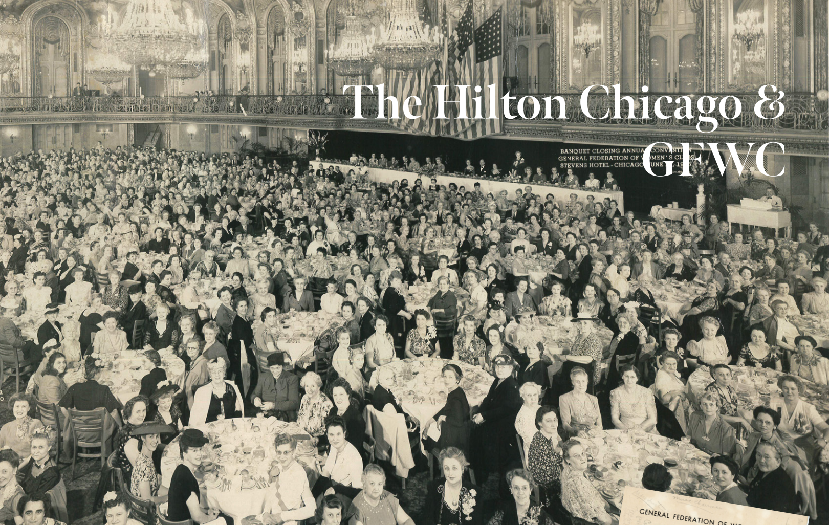
Pictured: Closing Banquet of the 1946 GFWC Annual Convention at the Stevens Hotel