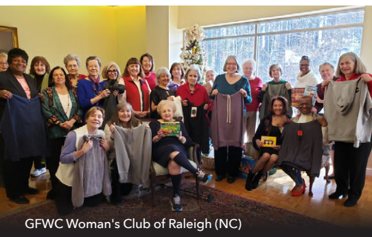
GFWC Woman's Club of Raleigh (NC)

Please be sure to spotlight your club's activities, by tagging GFWC on social media @GFWC and by adding #GFWCVIA. As always, thank you for Living the Volunteer Spirit!