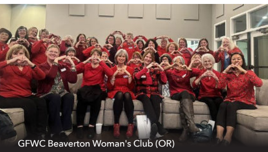
GFWC Beaverton Woman's Club (OR)