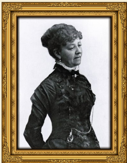
JANE CUNNINGHAM CROLY General Federation of Women's Clubs, Founder