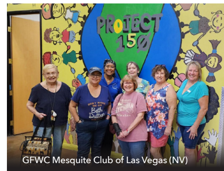
GFWC Mesquite Club of Las Vegas (NV)