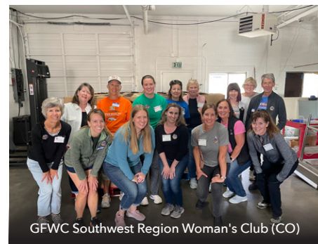
GFWC Southwest Region Woman's Club (CO)