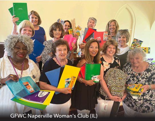
GFWC Naperville Woman's Club (IL)