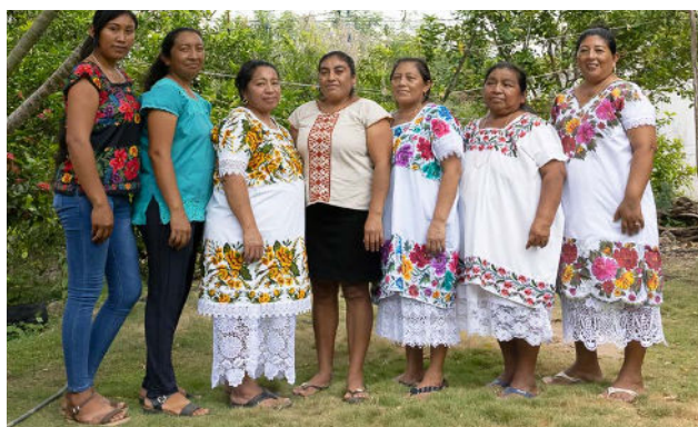
Women's poultry co-op in Mexico supported by GFWC

“ It doesn't take herculean actions or exhaustive energy. ”