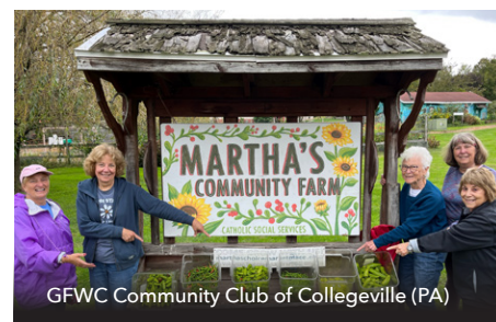
GFWC Community Club of Collegeville (PA)