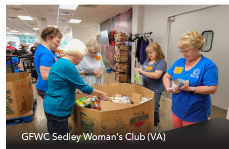
GFWC Sedley Woman's Club (VA)