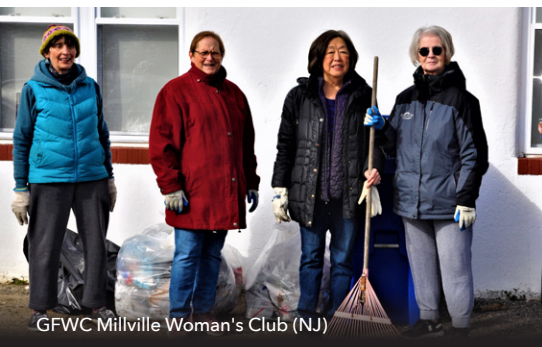
GFWC Millville Woman's Club (NJ)