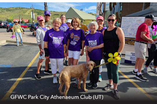
GFWC Park City Athenaeum Club (UT)

Please be sure to spotlight your club's activities, by tagging GFWC on social media @GFWC and by adding #GFWCVIA. As always, thank you for Living the Volunteer Spirit!