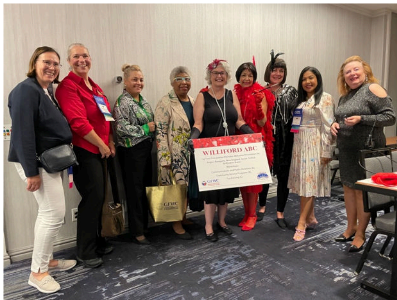
Pictured: First Time Attendees at the 2024 GFWC Annual Convention in Chicago.

By the end of the convention, you'll walk away with new friendships, a deeper understanding of GFWC's mission, and renewed motivation to make a difference in your community. Enjoy every moment—this is just the beginning of an unforgettable GFWC journey!